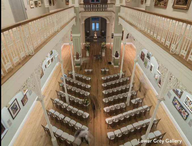
Lower Grey Gallery