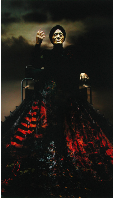
Image credit: Lisa Reihana Mahuika 2001 Auckland Art Gallery Toi o Tāmaki, purchased 2002. Courtesy of Artprojects © Lisa Reihana with thanks to Creative New Zealand.

Ko Toi Tū Toi Ora: Contemporary Māori Art , te whakaaturanga nui rawa i roto i ngā hītōria 132 tau o Toi o Tāmaki.